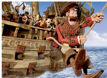
Codsteaks- set build