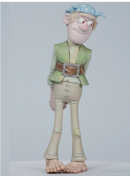
Aardman Features Ltd